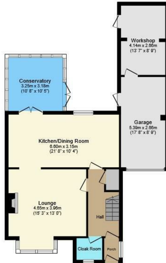
Ground Floor Floor area 90.0 sq.m. (969 sq.ft.)