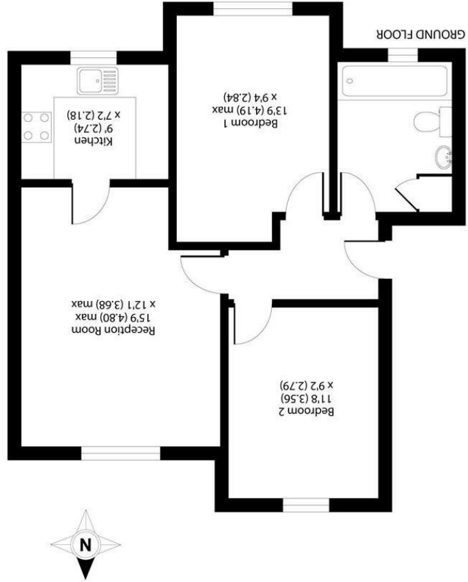
APPROX. GROSS INTERNAL FLOOR AREA 608 SQ FT 56.4 SQ METRES

34 Richmond Road Kingston upon Thames Surrey KT2 6ED www.gibsonlane.co.uk Tel: 020 8546 5444