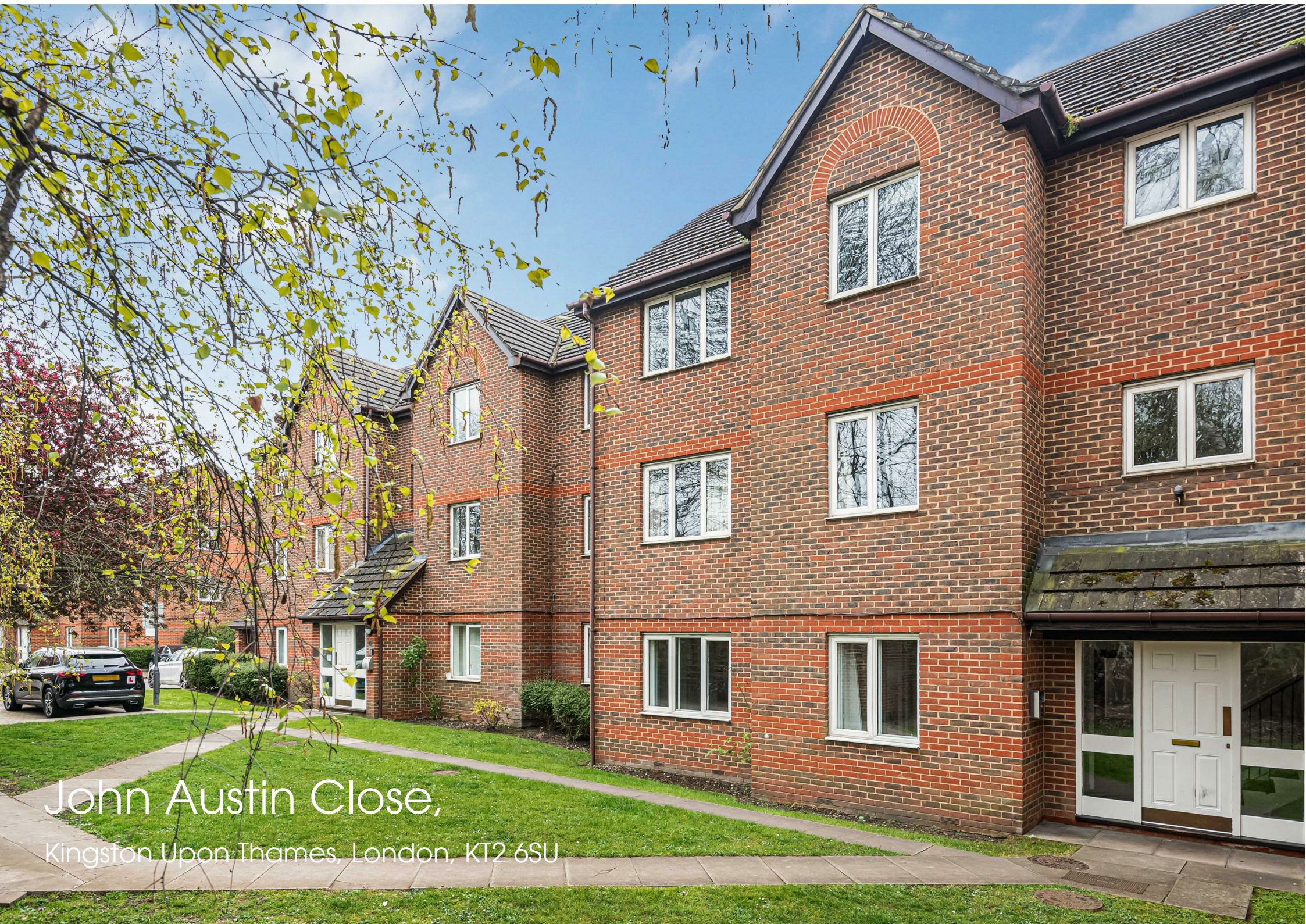
John Austin Close, Kingston Upon Thames, London, KT2 6SU