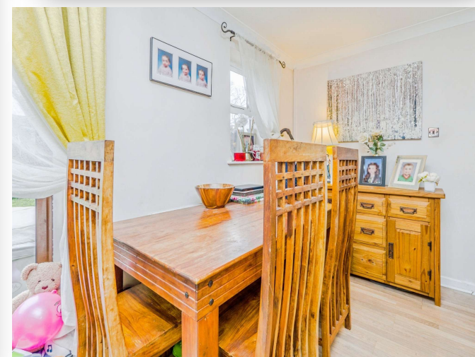
Thrush Close, St. Mellons Cardiff CF3 0PE