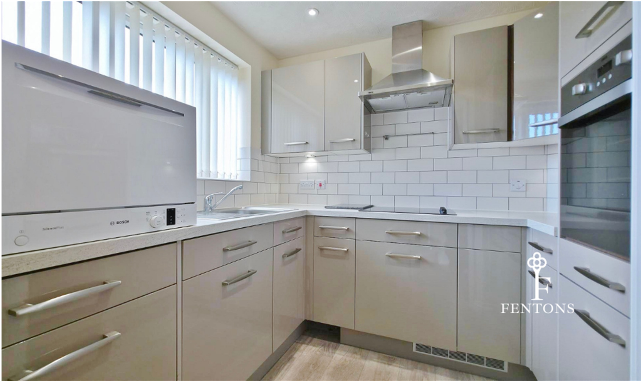
APARTMENT 3 COOPER LODGE, POLE BARN LANE, FRINTON-ON-SEA, ESSEX, CO13 9NH