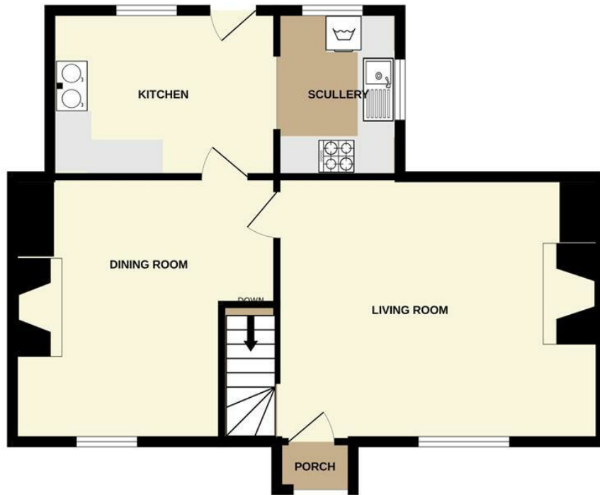
GROUND FLOOR 604 sq.ft. (56.1 sq.m.) approx.