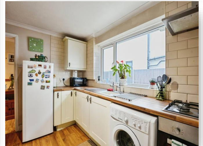
Burgh Road, Skegness PE25 2LW