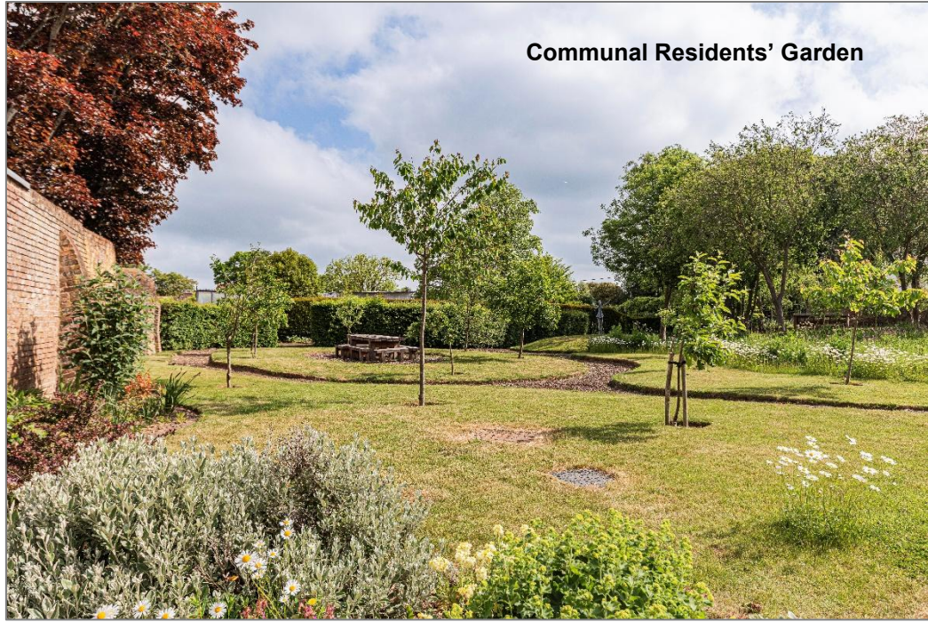
Communal Residents' Garden