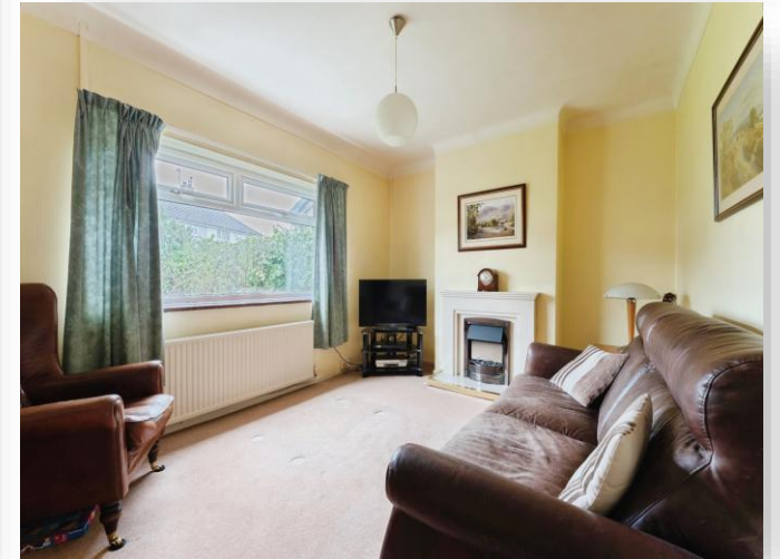
Woodchurch Road, Prenton, CH43 0TR