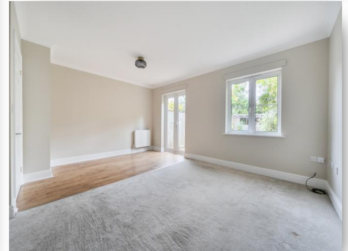
2 Beechfield Place, Maidenhead SL6 4BP