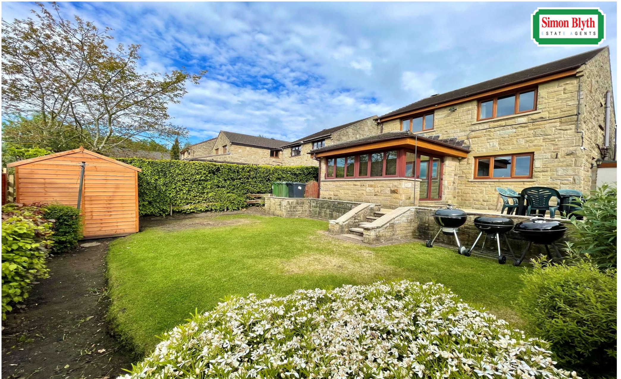
3 Woodleigh Grove, Beaumont Park, Huddersfield, HD4 7AN