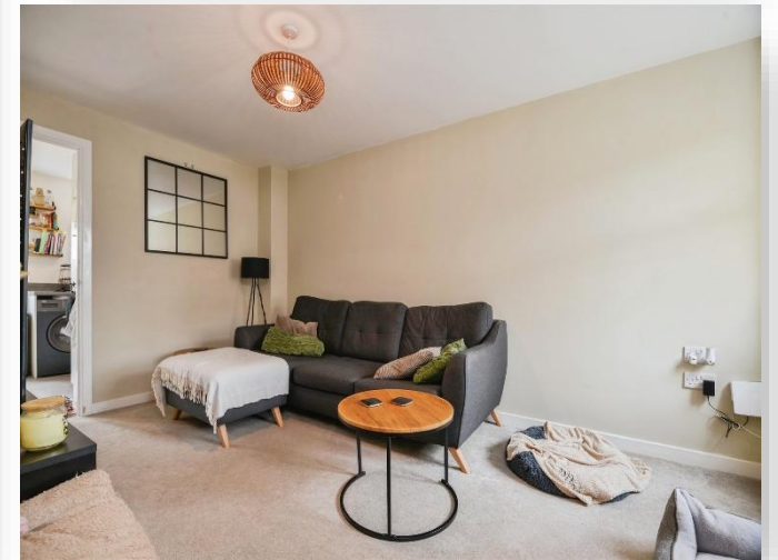
Spencer Drive, Stockton-On-Tees TS20 1FG