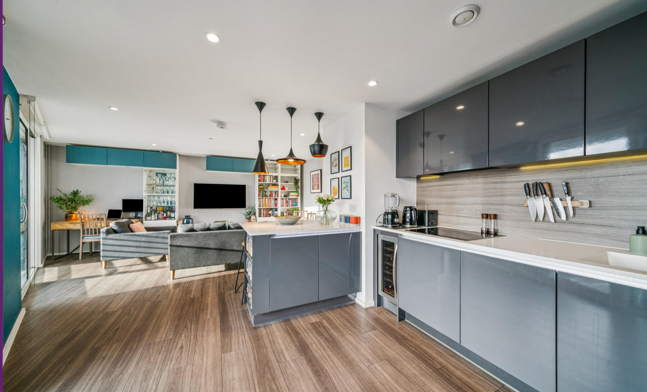
Copperlight Apartments 16 Buckhold Road, SW18