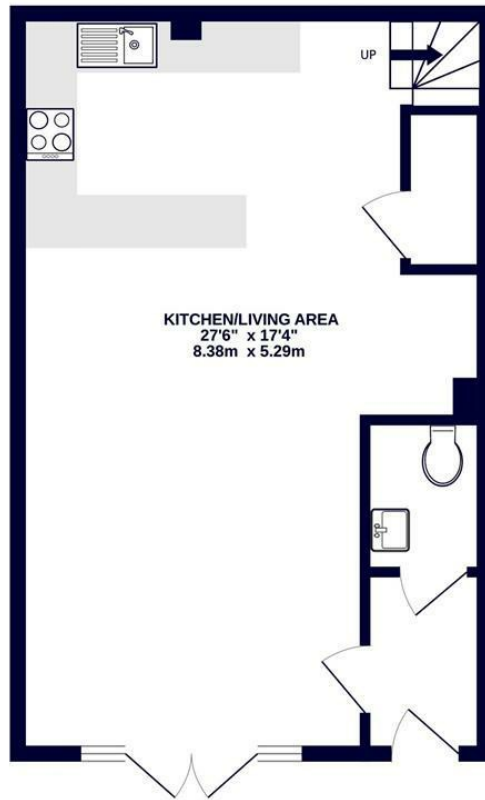
GROUND FLOOR 475 sq.ft. (44.2 sq.m.) approx.