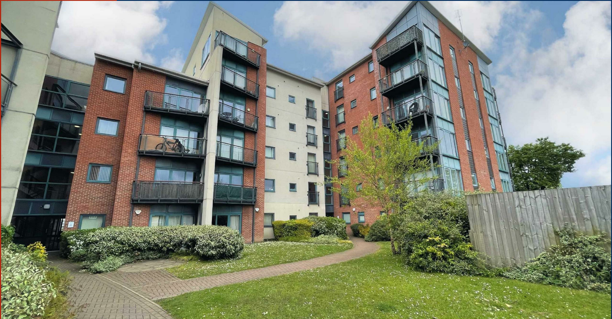
Apt 50 Compass Point, Manchester, M23 1ED