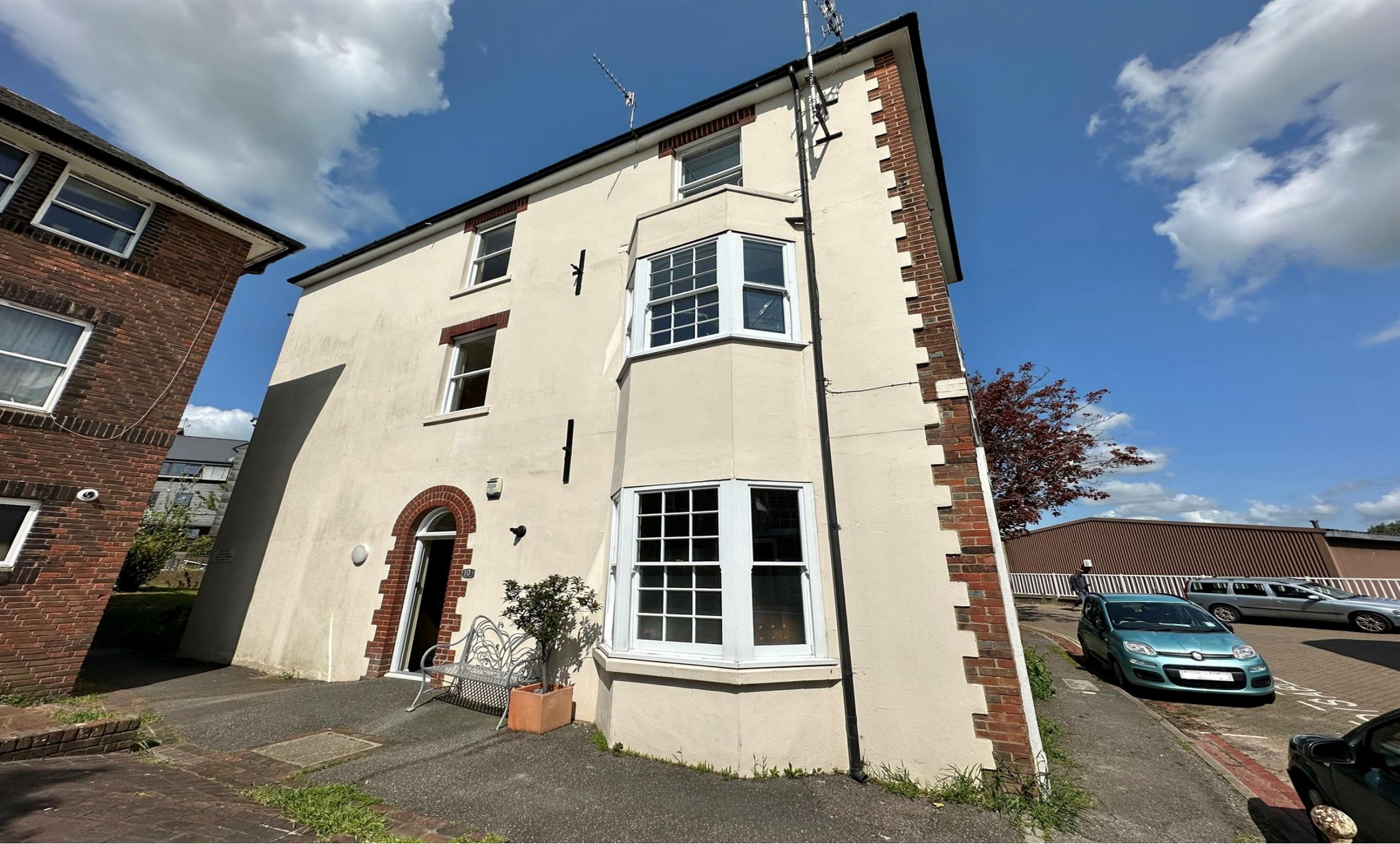
Waterloo Place, Lewes BN7 2PP