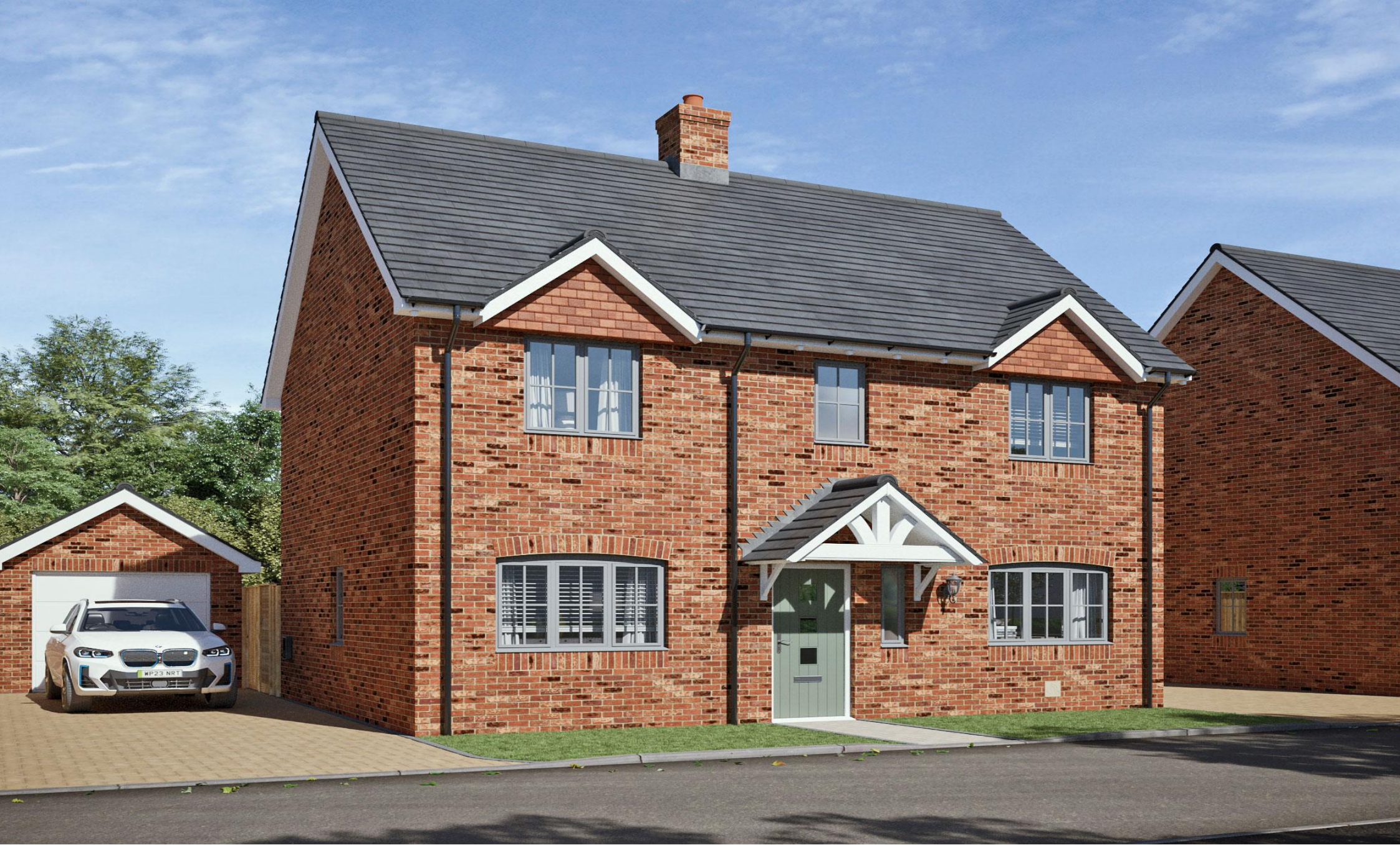
The Anderwood Brockhills Lane, New Milton BH25 5QL