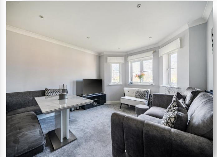
Flat 7 Regents Place, 48 Bath Road, Maidenhead SL6 4JX