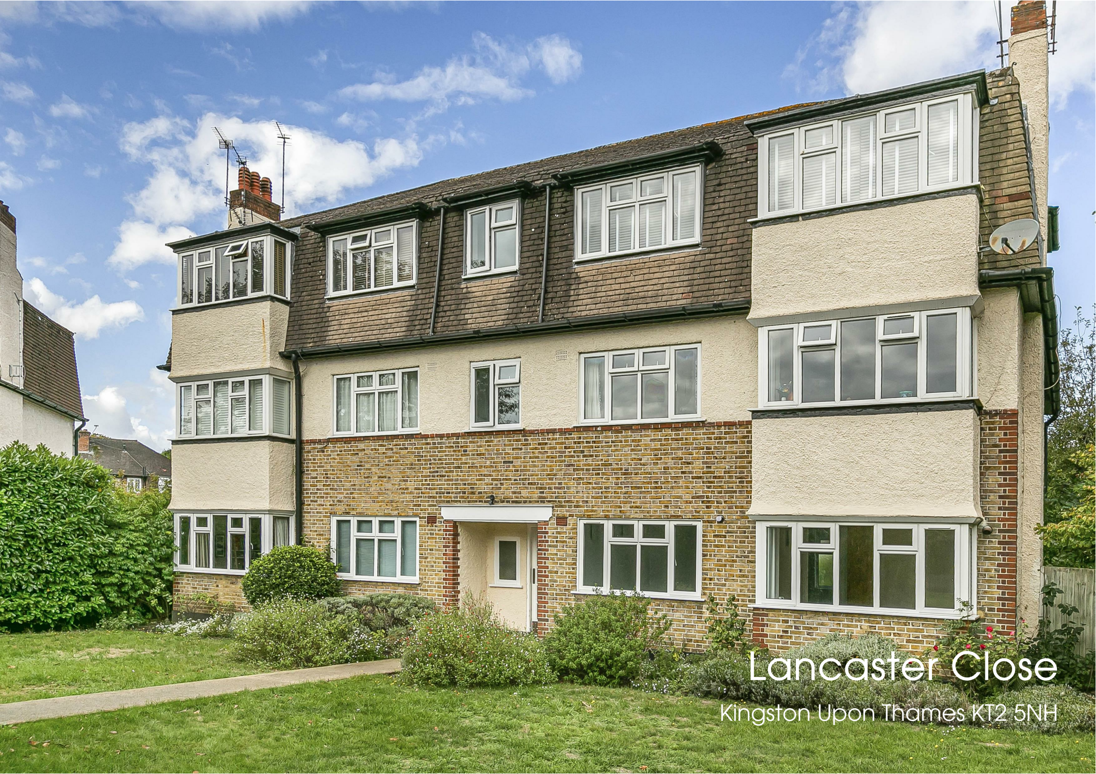
Lancaster Close Kingston Upon Thames KT2 5NH

Kingston Office 34 Richmond Road Kingston upon Thames Surrey KT2 5ED T: 020 8546 5444 Horn Office 323 Richmond Road Kingston upon Thames Surrey KT2 5QU T: 020 8247 9444 www.gibsonlane.co.uk gibson lane