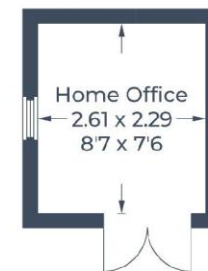
(Not Shown In Actual Location / Orientation)

Illustration for identification purposes only, measurements are approximate, not to scale.