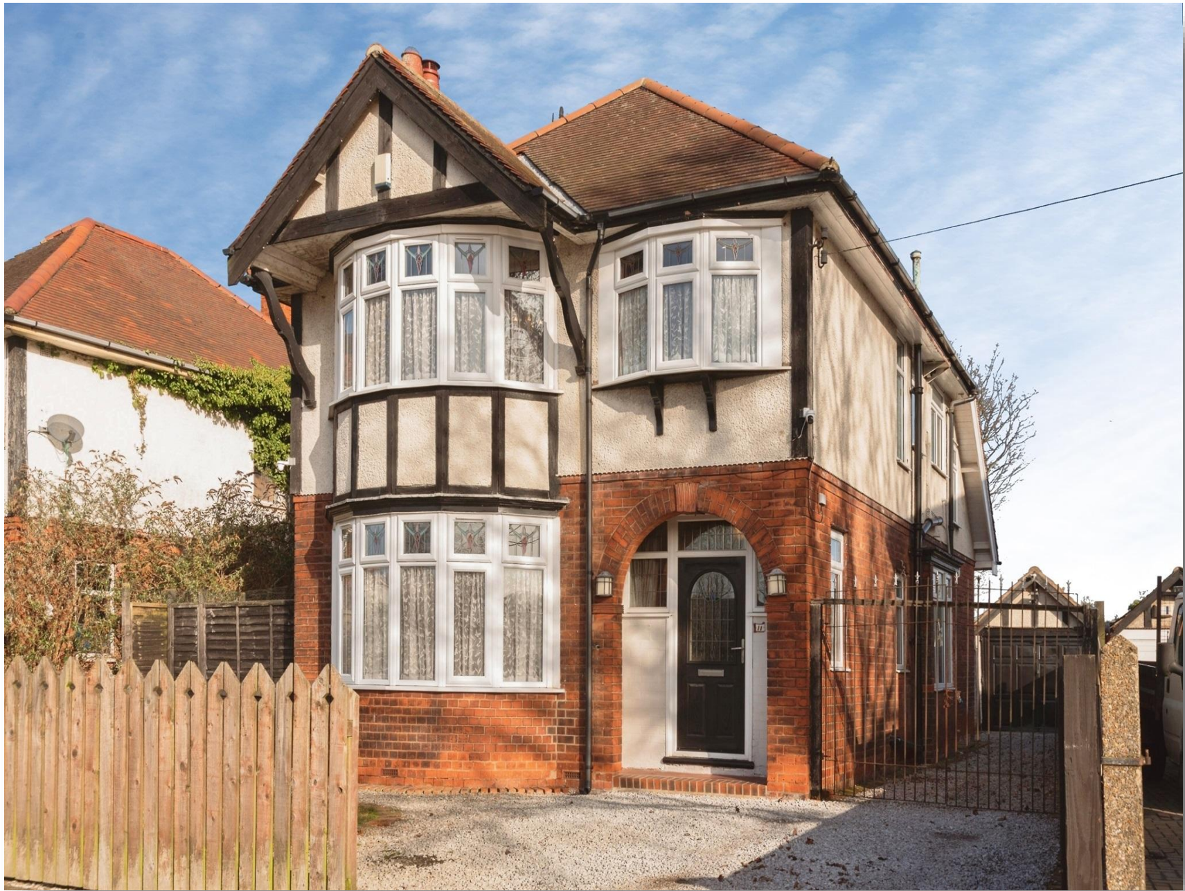
Maybury Road, Hull, HU9 3LN