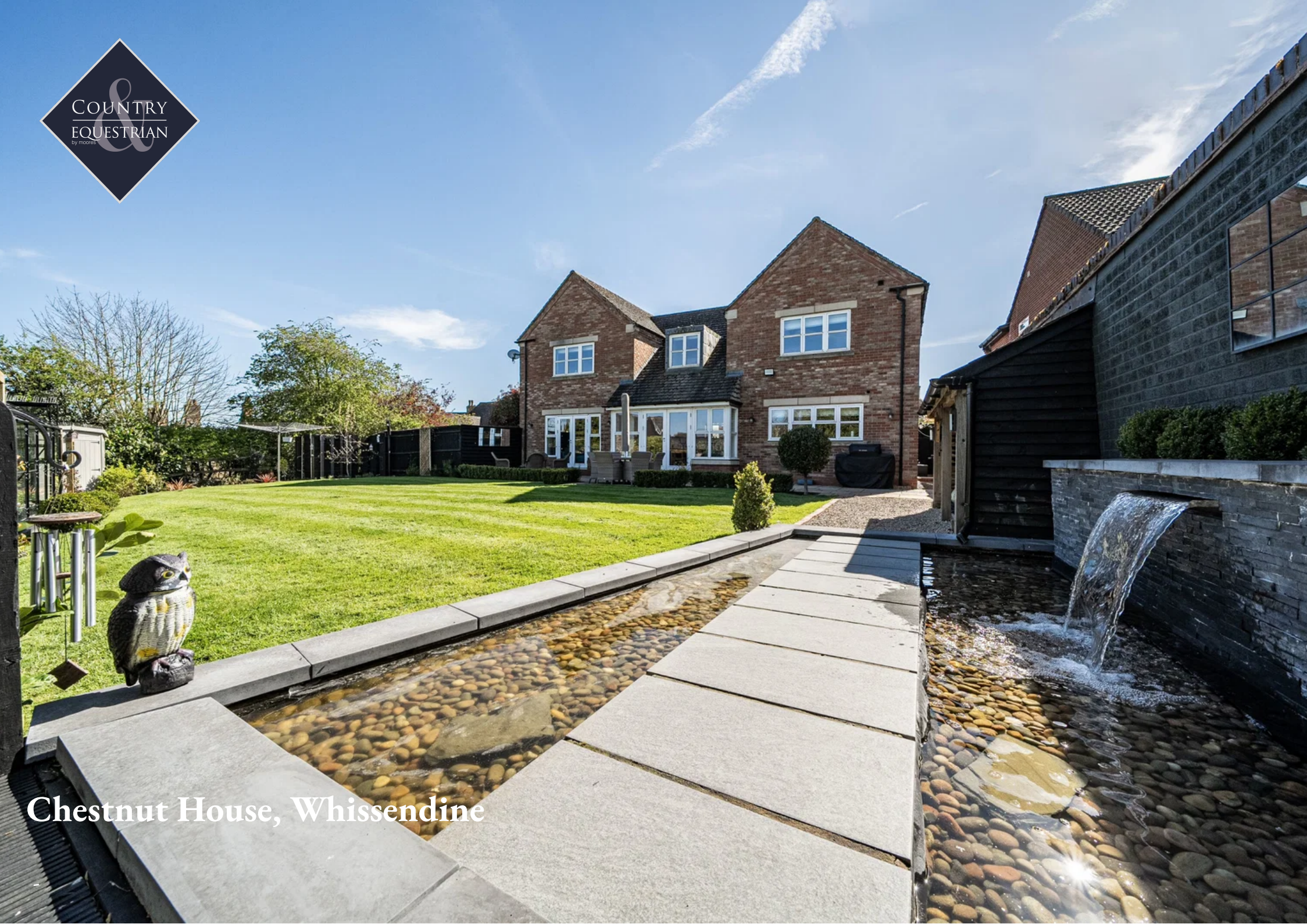
Chestnut House, Whissendine