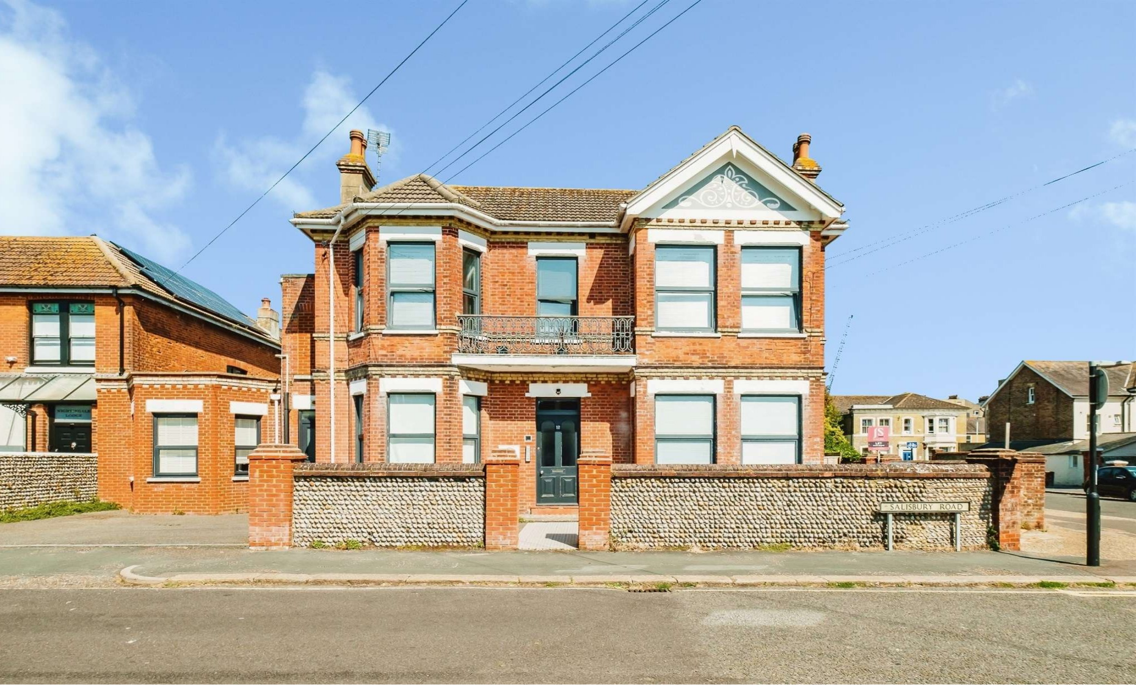
Shelley Road, Worthing BN11 1TR