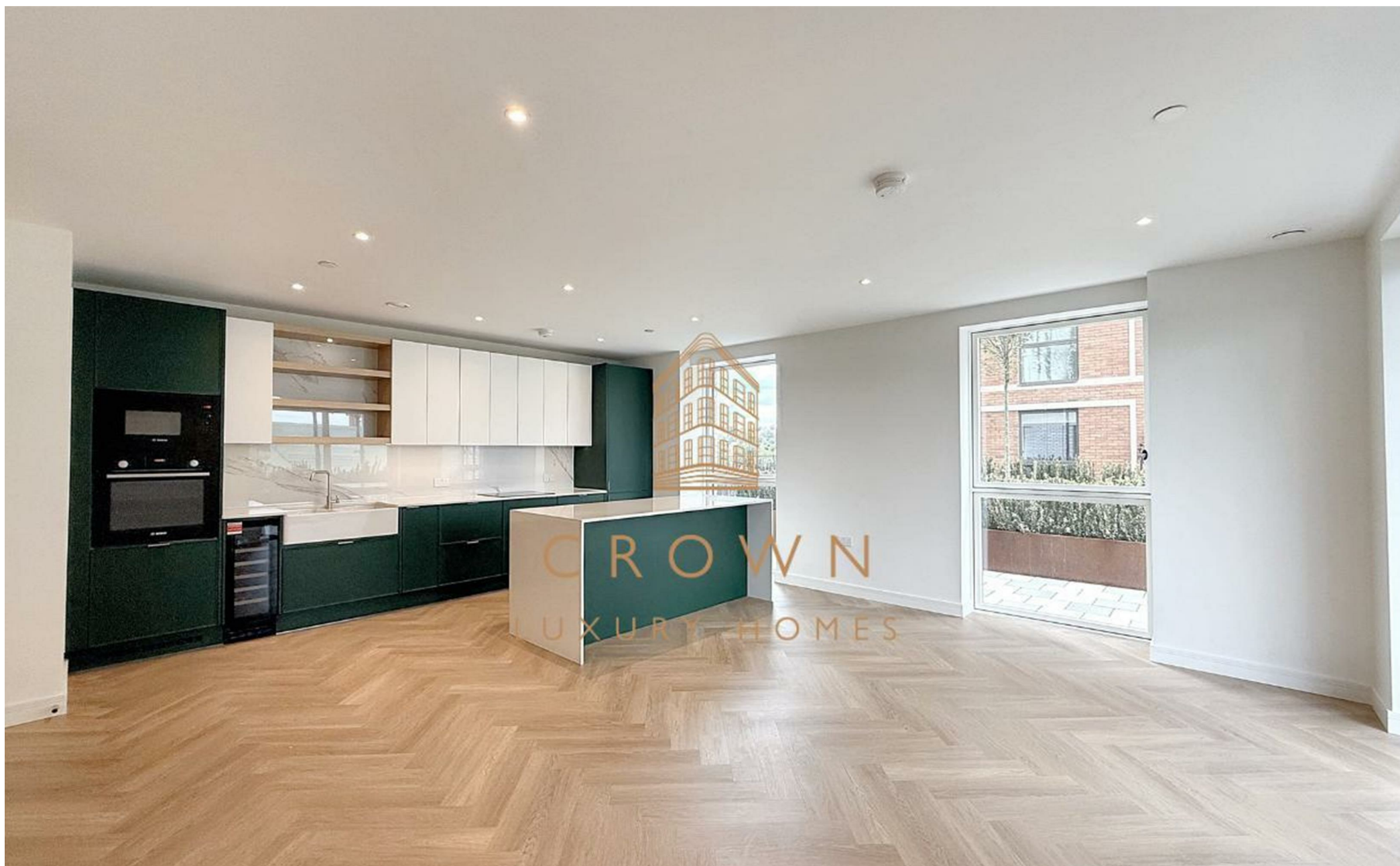
6 Lindley House 1 Henshaw Parade, The Hyde, London, NW9 6GF £690,000