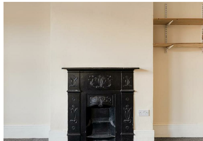
Reception Room 15'11" x 13'4"