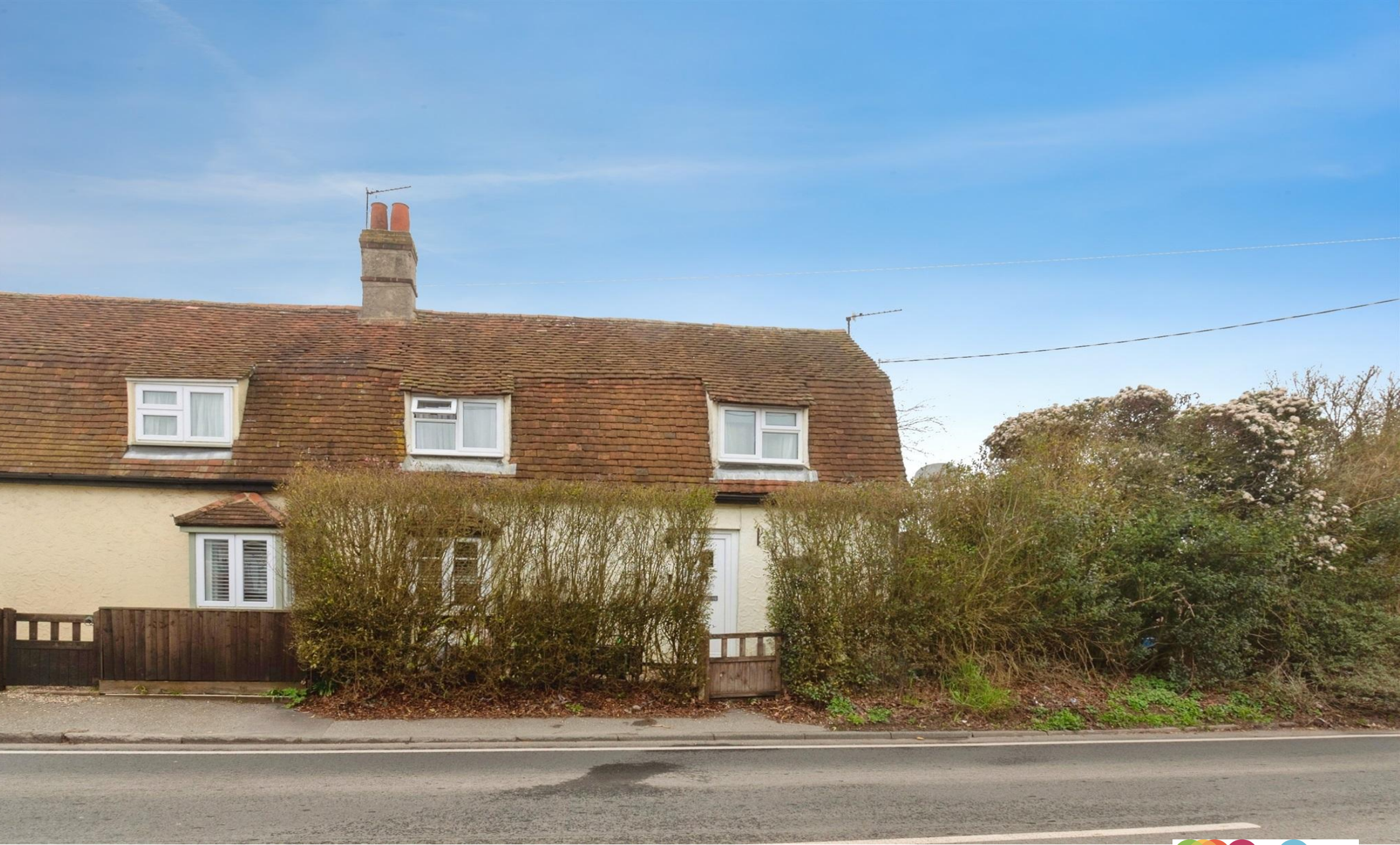
April Cottage, Panfield Lane, BRAINTREE, CM7 5RW