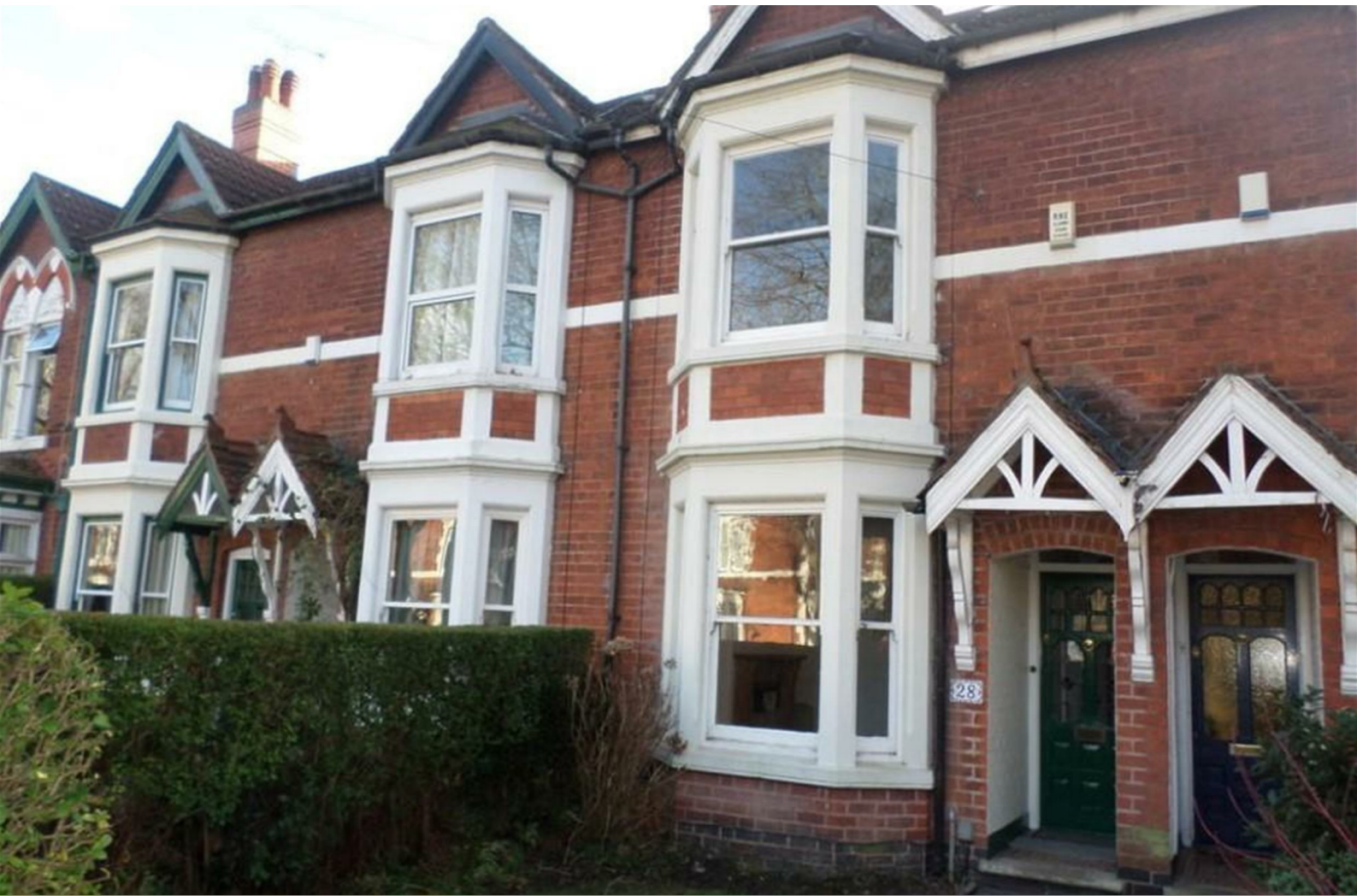
28 Third Avenue, Birmingham, B29 7EX