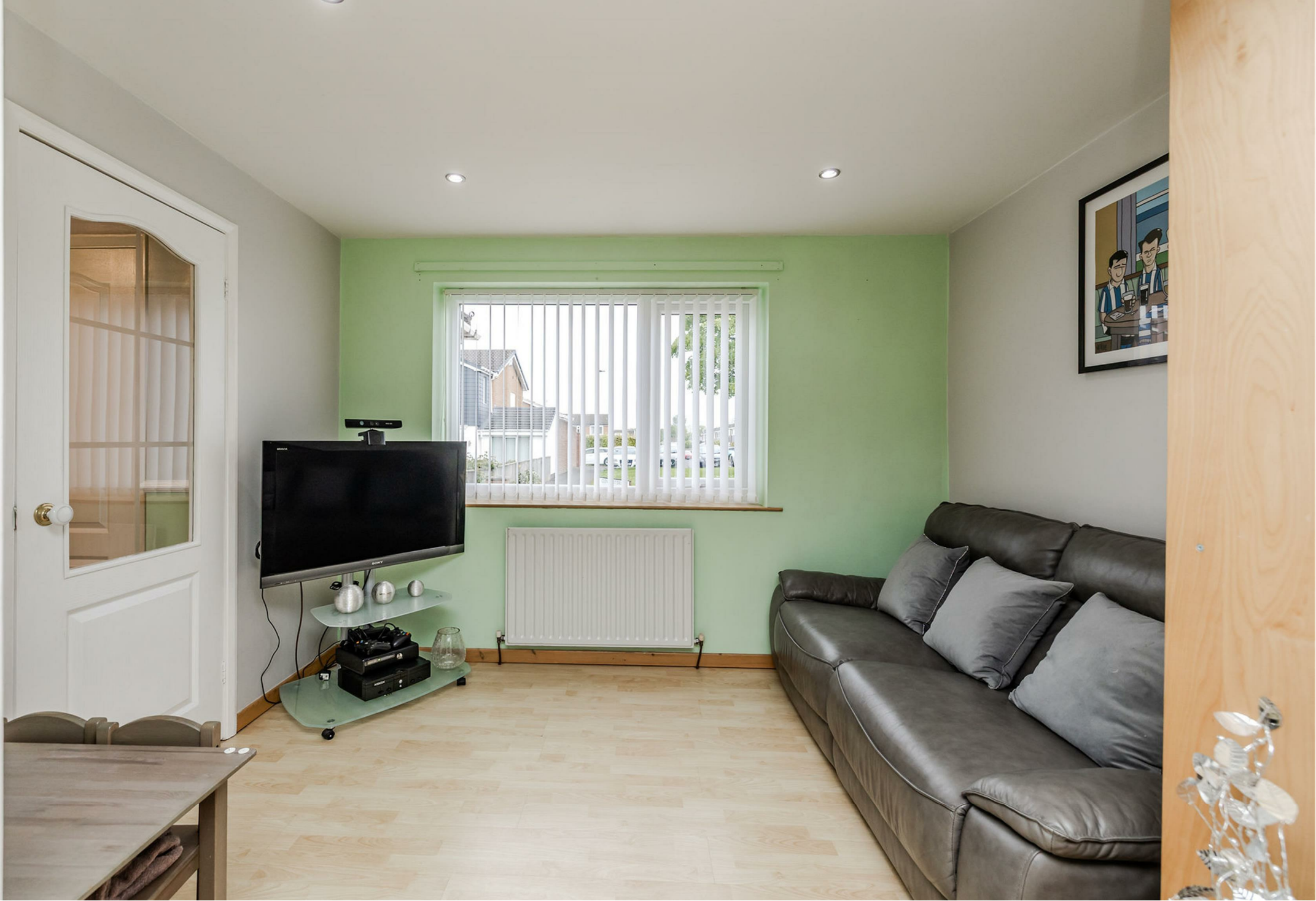
23 Glenwood Walk, Chapel Park, Newcastle Upon Tyne, NE5 1SS