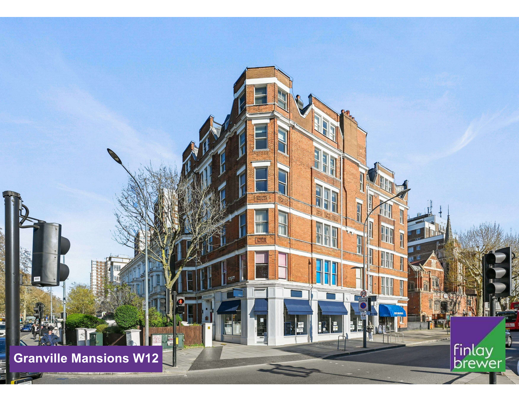
Granville Mansions W12