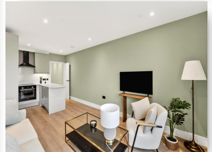
Foundry House, Elm Grove, London SW19 4HE