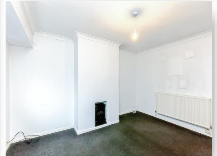
Orchard Crescent, KETTERING NN16 9PP