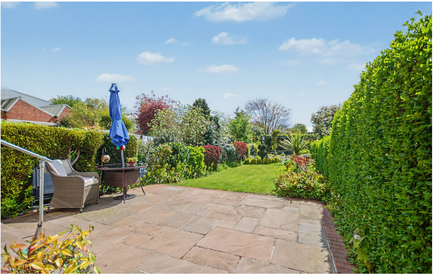
A TWO DOUBLE BEDROOM EXTENDED MID TERRACE IN SOUGHT AFTER BREASTON VILLAGE WITH OPEN PLAN LIVING AND BEAUTIFUL REAR GARDEN BACKING ONTO PARK.

Situated in the highly desirable village of Breaston, this two double bedroom mid terrace property has been extended to create a spacious open plan living layout and is presented as a well maintained home, ideal for a range of buyers. The accommodation benefits from gas central heating and double glazing throughout and has been carefully looked after by the current owner, including the recent addition of new soffits, fascias and guttering. The extension to the rear provides a light and airy open plan living space, perfect for modern day living and entertaining. To the first floor, there are two well proportioned double bedrooms and a bathroom. A particular feature of the property is the beautifully established rear garden which backs directly onto a park, offering a private and attractive outdoor space to enjoy. Located close to local amenities, schools and transport links, this is a fantastic opportunity to purchase a home in one of the area's most sought after villages.