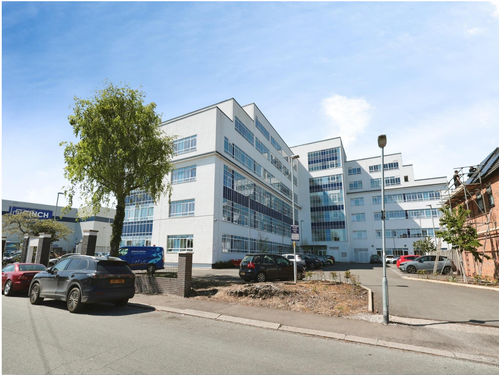
Yeatman Court, Cherry Tree Road, Watford. WD24 6AF