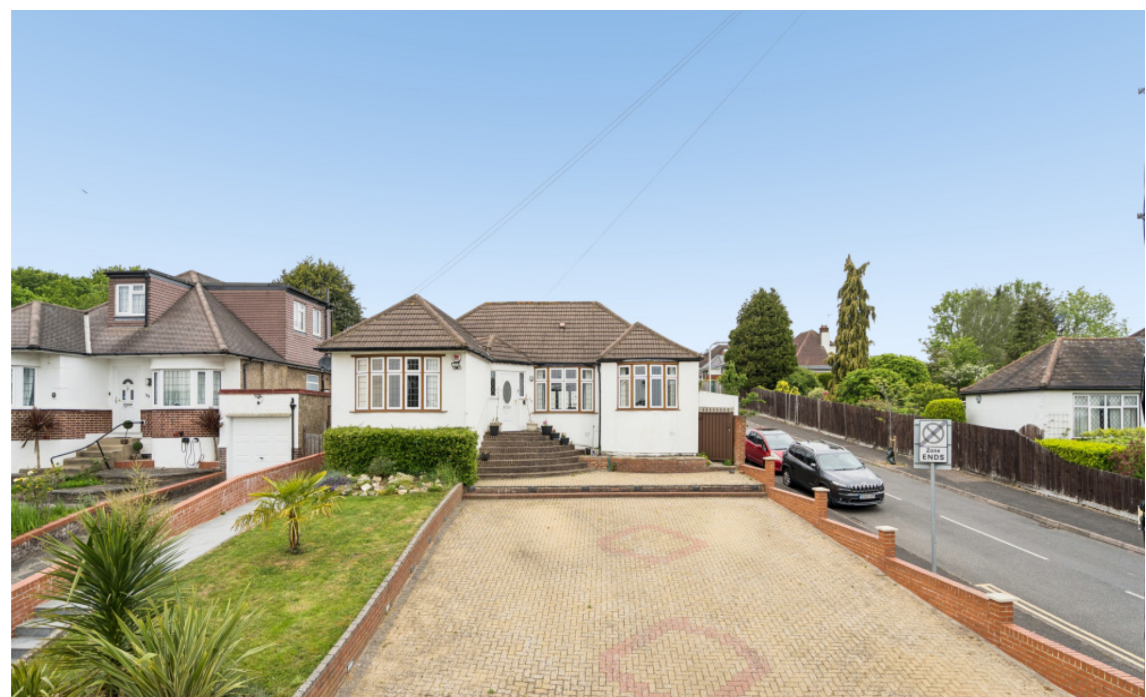
A 3/4 bedroom bungalow in a sought after road Stanley Road, Northwood, HA6 1RQ