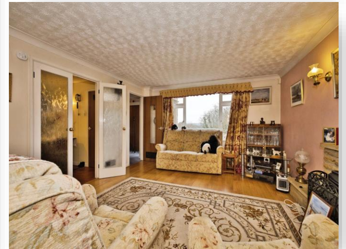
Manor Park Villa, Kingsdon, Somerton, TA11 7LL