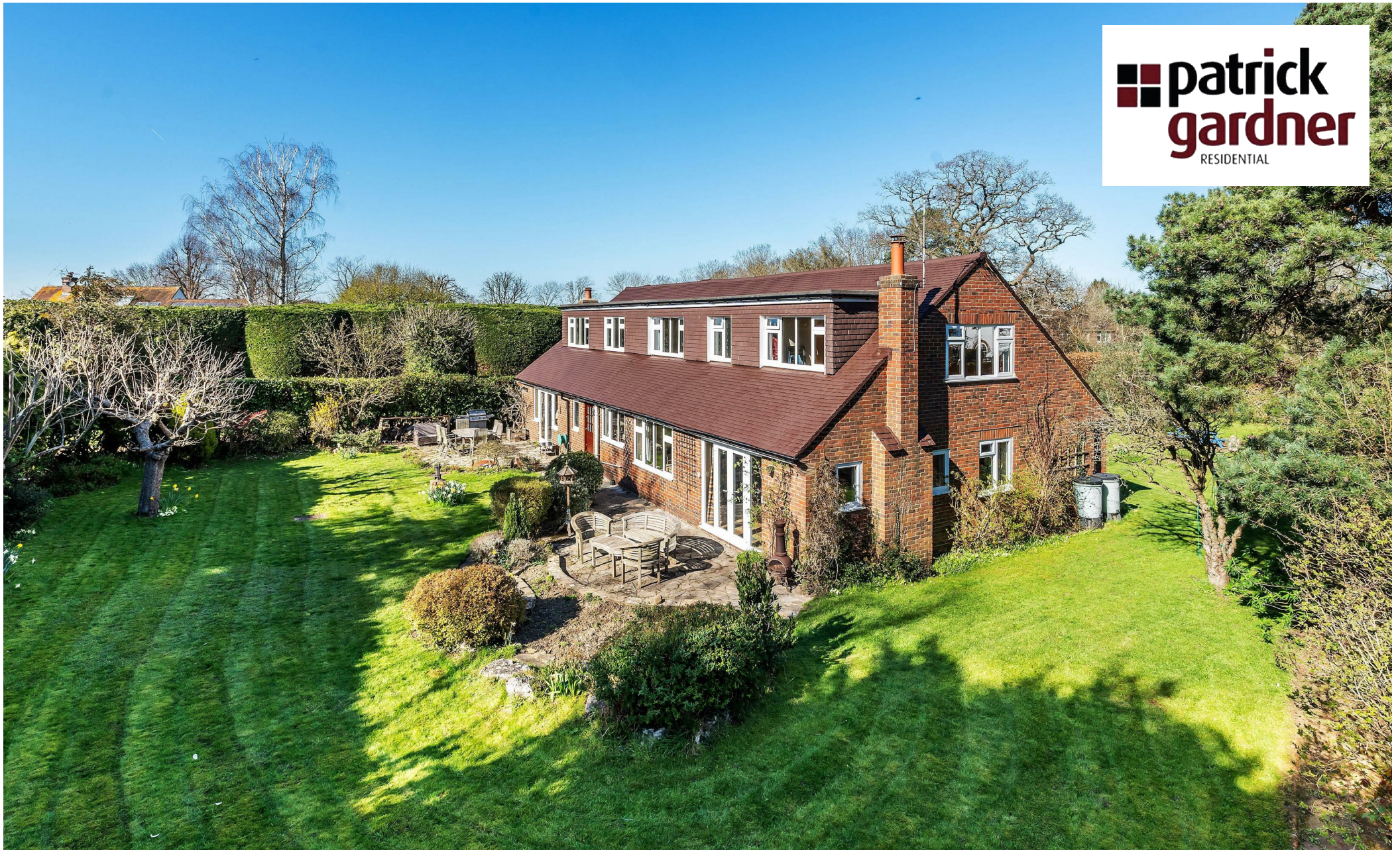
Applewood Maddox Lane, Little Bookham, Surrey, KT23 3BS