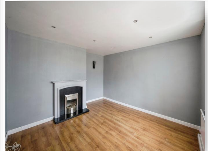
Maori Avenue, Bolton-Upon-Dearne Rotherham S63 8DX