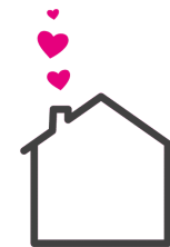
Illustration for identification purposes only, measurements are approximate, not to scale. Fourlabs.co © (ID1301321)

home sweet home estate agents your local property experts