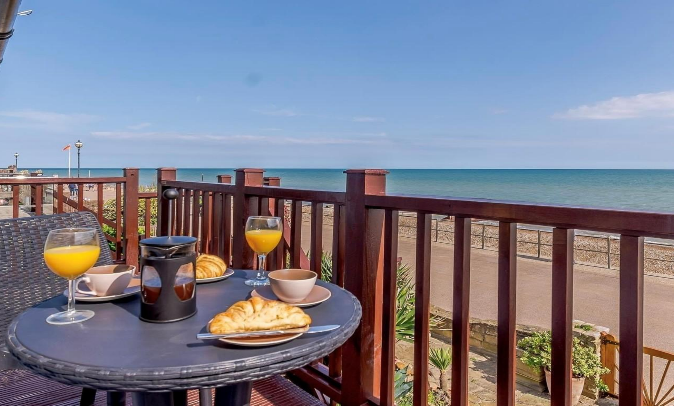
Channel View, Bexhill-On-Sea TN40 1JT