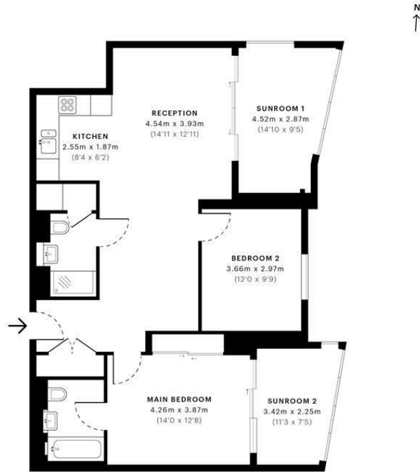
— Tenth Floor