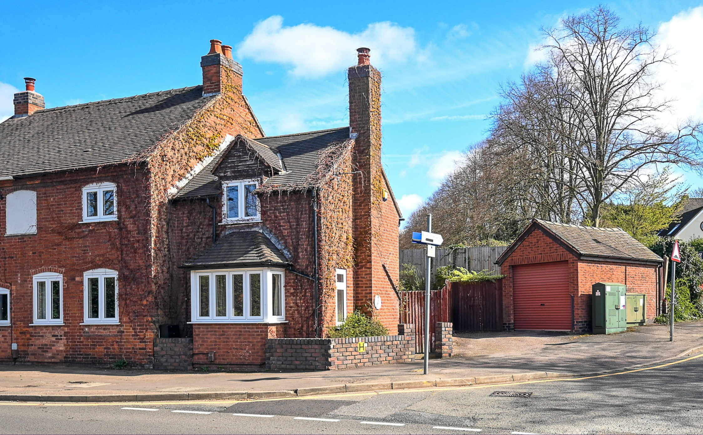
Borrowcop Cottage, 233 Upper Saint Johns Street, Lichfield, WS14 9ED