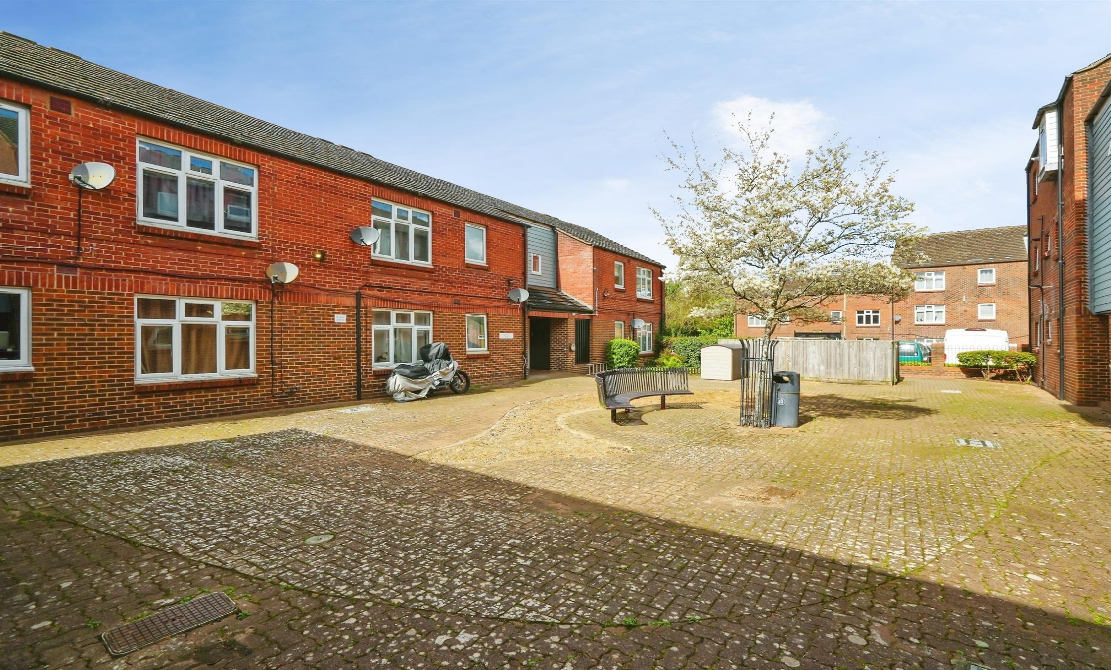
Kibble Close, Didcot, OX11 8DE