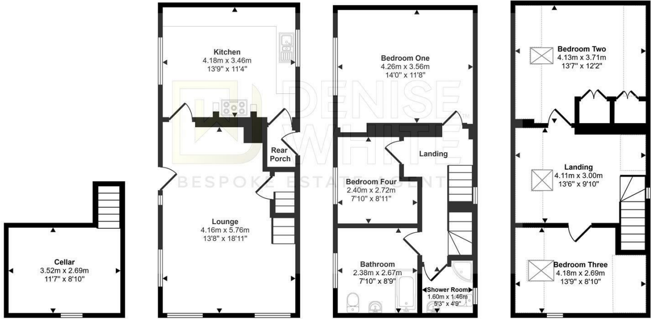
Cellar Approx 10 sq m / 112 sq ft

Approx Gross Internal Area 130 sq m / 1399 sq ft