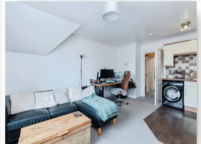
Victory Court Lowther Road, BOURNEMOUTH BH8 8NG