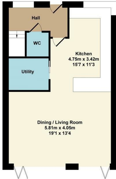
Ground Floor Approx. Floor Area 50.8 Sq.M. (547 Sq.Ft.)

Whilst every attempt has been made to ensure the accuracy of the floor plan contained here, measurements of doors, windows, rooms and any other items are approximate and no responsibility is taken for any error, omission, or mis-statement. This plan is for illustrative purposes only and should be used as such by any prospective purchaser. The services, systems and appliances shown have not been tested and no guarantee as to their operability or efficiency can be given.