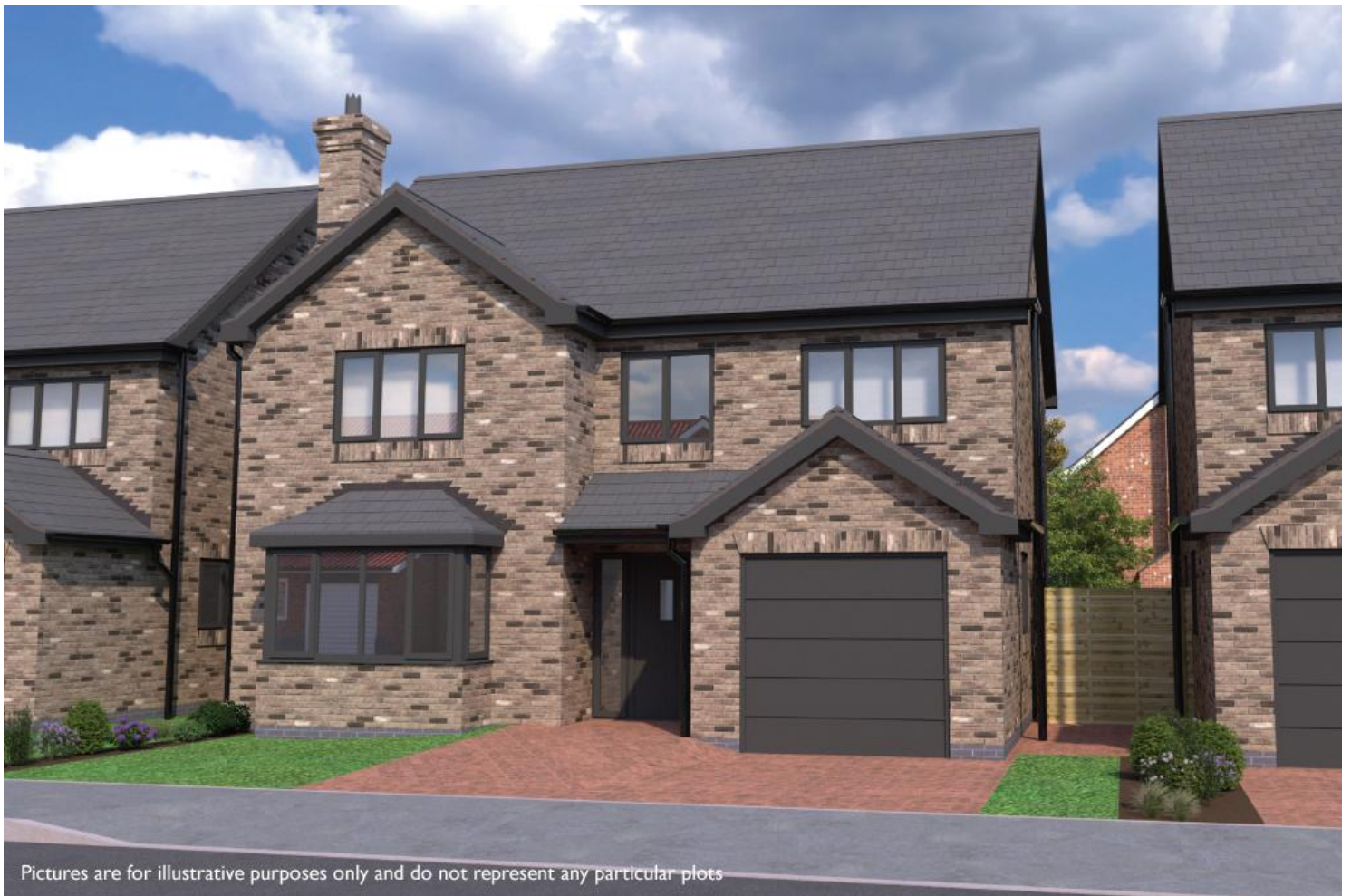
Pictures are for illustrative purposes only and do not represent any particular plots