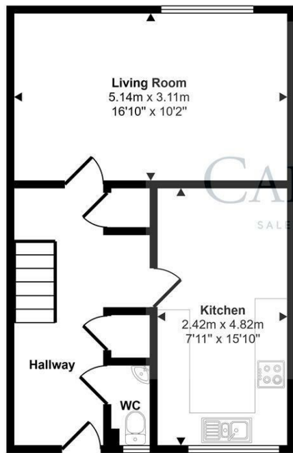
Ground Floor Approx 42 sq m / 447 sq ft

Approx Gross Internal Area 84 sq m / 899 sq ft