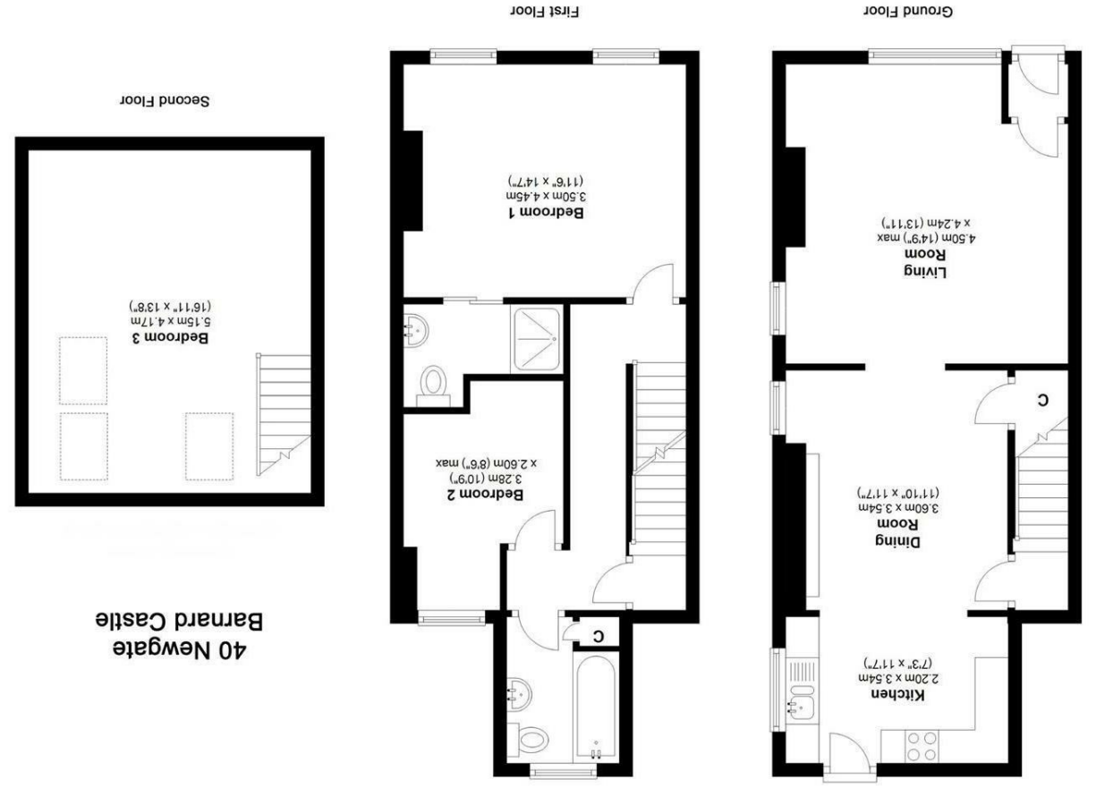
40 Newgate Barnard Castle

Whilst every attempt has been made to ensure the accuracy of the floorplans contained here, measurements of doors, windows, rooms and any other items are approximate and no responsibility is taken for any error, omission or mis-statement. This plan is not drawn to scale and is for illustrative purposes only & should be used as such by any prospective purchaser. Created especially for GSC Grays by Vuesky Ltd