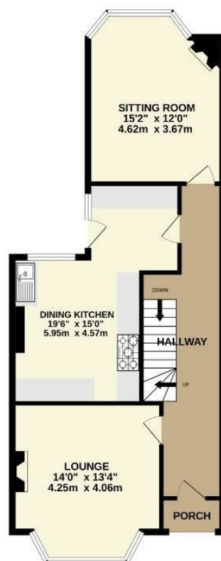
GROUND FLOOR 720 sq.ft. (66.9 sq.m.) approx.