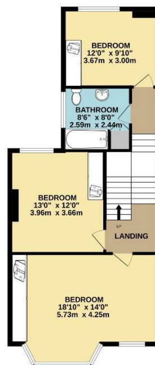
1ST FLOOR 690 sq.ft. (64.1 sq.m.) approx.