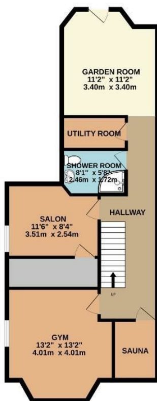
BASEMENT 720 sq.ft. (66.9 sq.m.) approx.