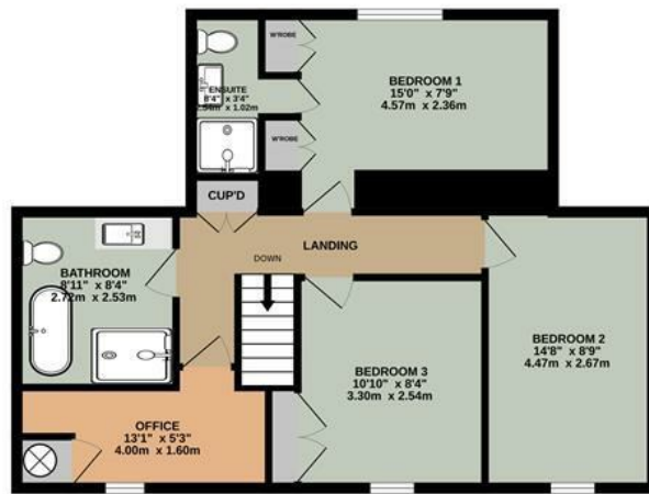
TOTAL FLOOR AREA : 1348 sq.ft. (125.2 sq.m.) approx.

Whilst every attempt has been made to ensure the accuracy of the floorplan contained here, measurements of doors, windows, rooms and any other items are approximate and no responsibility is taken for any error, omission or mis-statement. This plan is for illustrative purposes only and should be used as such by any prospective purchaser. The services, systems and appliances shown have not been tested and no guarantee as to their operability or efficiency can be given. Made with Metropix ©2025