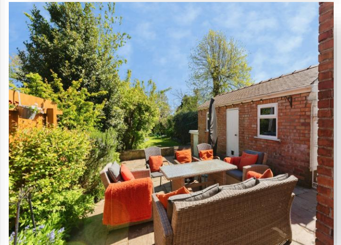
Highfield South, Rock Ferry, Birkenhead, CH42 4ND